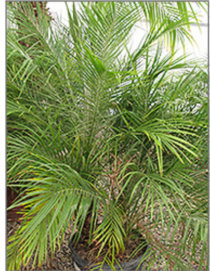
Pygmy Date Palm (shrub form)

Pygmy Date Palm (shrub form) makes a fine choice for the outdoor landscape, but it is also well-suited for use in outdoor pots and containers. Because of its height, it is often used as a 'thriller' in the 'spiller-thriller-filler' container combination; plant it near the center of the pot, surrounded by smaller plants and those that spill over the edges. It is even sizeable enough that it can be grown alone in a suitable container. Note that when grown in a container, it may not perform exactly as indicated on the tag - this is to be expected. Also note that when growing plants in outdoor containers and baskets, they may require more frequent waterings than they would in the yard or garden.