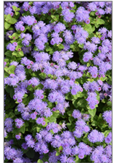
Aguilera Sky Blue Flossflower flowers

Aguilera Sky Blue Flossflower is recommended for the following landscape applications;